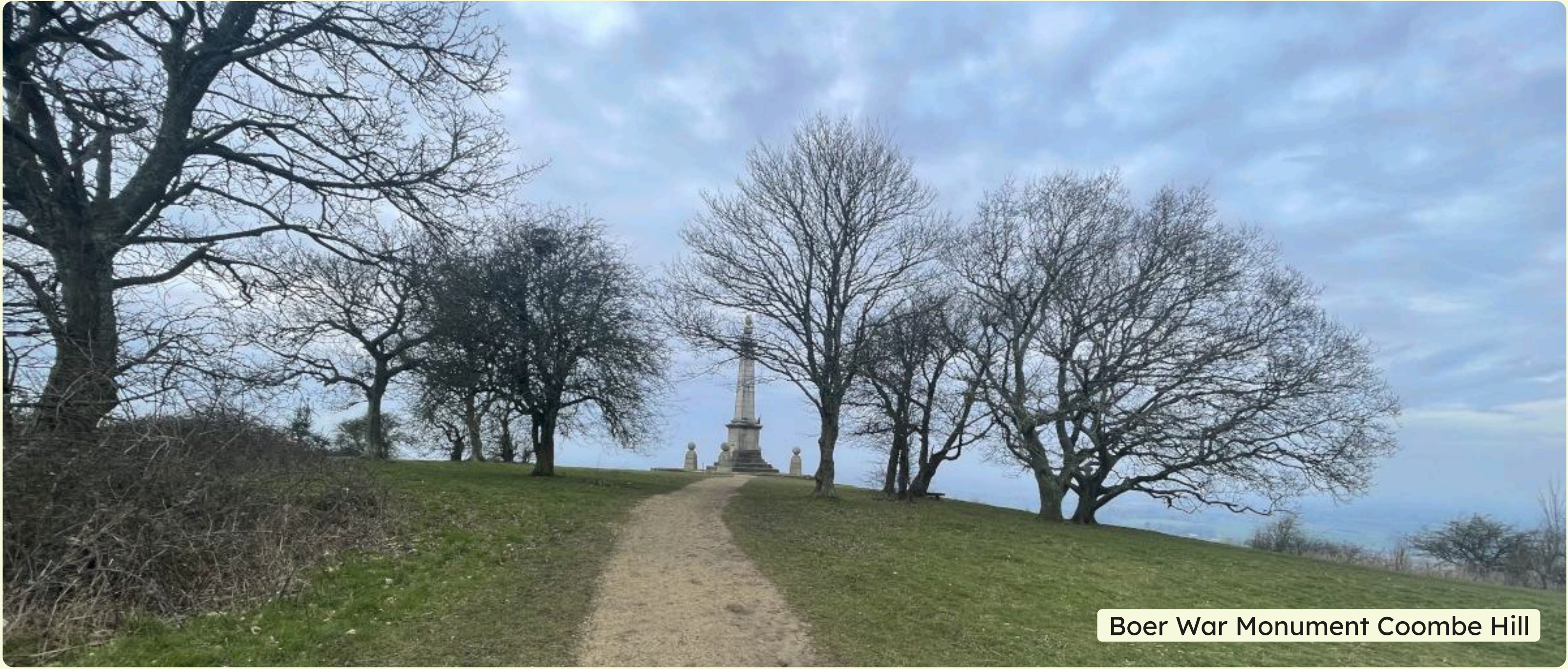
Boer War Monument Coombe Hill