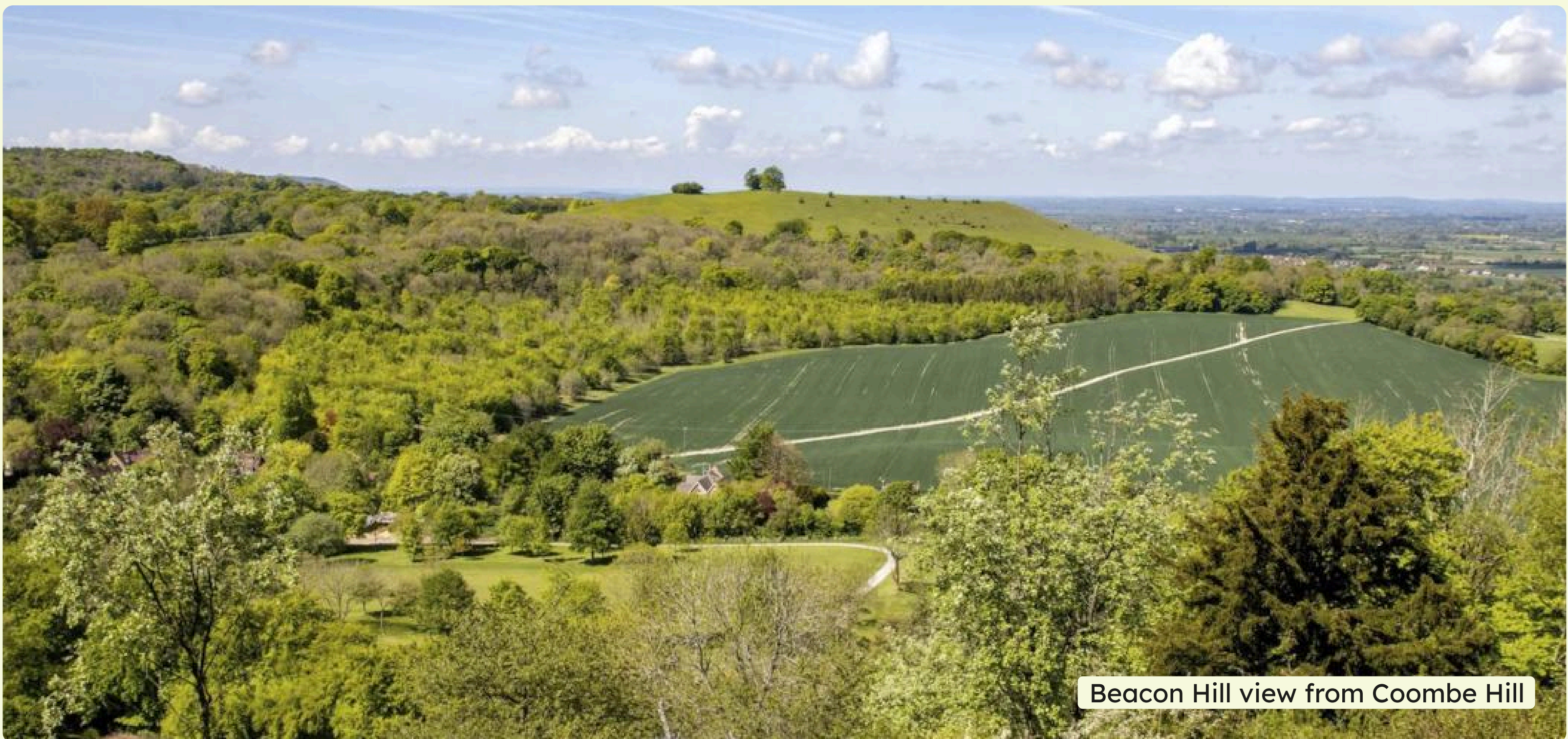
Beacon Hill view from Coombe Hill

Just outside Butlers Cross, near Wendover. At the Russell Arms pub, turn into Missenden Road, continue up Missenden Road and turn into Lodge Hill. Carry on for a mile and the car park is at the turn in the road.